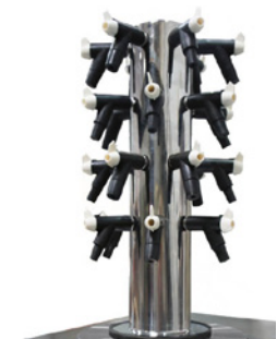
LSPM24 24-Port SS Drying Manifold

UK designed, manufactured and supported, the LyoDry Benchtop Pro offers a superior, keenly priced, freeze drying solution with enhanced functionality, ideal for freeze drying a wide variety of samples.