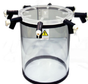
LSDCV 8-Port Acrylic Chamber