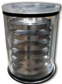
LSAD6 Chamber and Tray Drying Accessory

This robust design includes a smooth wall, stainless steel ice condenser with a front mounted bottom drain and USB connection. The LyoDry Benchtop was originally designed as a direct replacement for the Edwards Modulyo® benchtop freeze dryer. Many standard Modulyo drying accessories (e.g. acrylic chamber, tray drying accessory, etc) are directly interchangeable, offering significant cost savings if only the condenser needs replacing. Choose from a variety of LyoDry accessories to accommodate bulk materials, flasks, vials and ampules.